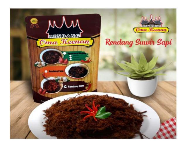
6. Crispy Jerked Beef Lung- Rendang