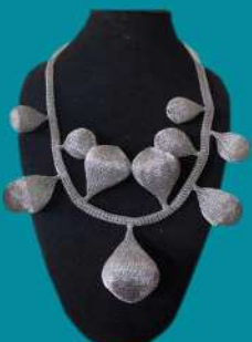
Mesh Necklace (NJN0049) Material : 0.3 Milimeters Wire, Handmade. Available in : Gold, Rose Gold, Silver, and Dark Copper