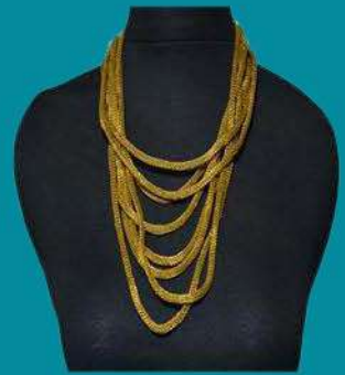
Mesh Necklace (NJN0017)

Available in : Gold, Rose Gold, Silver, and Dark Copper