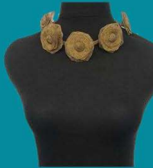
Mesh Necklace (NJN0011)

Available in : Gold, Rose Gold, Silver, and Dark Copper