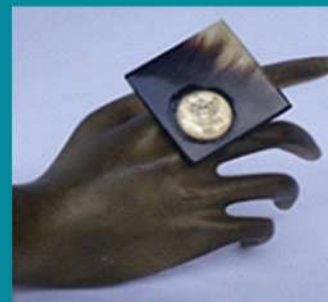
Horn Ring (NJR0013) Material : Water Buffalo Horns, and Indonesian Old Coin.