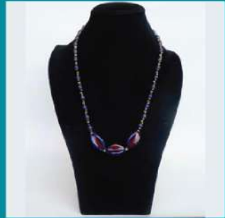
Stone Glass Bead Necklace (NJN0066) Material : Stone Glass Bead Length : By Request