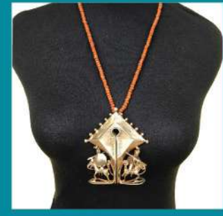
Mamuli Necklace (NJN0067) Material : Motte Beads and Metal Length : By Request