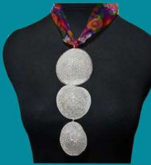
Mesh Necklace (NJN0019)

Available in : Gold, Rose Gold, Silver, and Dark Copper