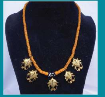
Mamuli Necklace (NJN0068) Material : Motte Beads and Metal Length : By Request