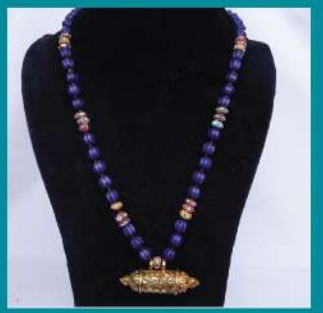
Amulet Necklace (NJN0071) Material : Amulet Pendant and Glass Bead Length : By Request