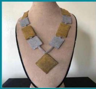
Mesh Necklace (NJN0054) Material : 0.3 Millimeters Wire, Handmade.