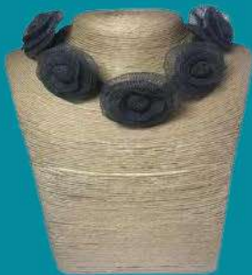
Mesh Necklace (NJN0013)

Available in : Gold, Rose Gold, Silver, and Dark Copper