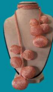
Mesh Necklace (NJN0047) Material : 0.3 Milimeters Wire, Handmade. Available in : Gold, Rose Gold, Silver, and Dark Copper