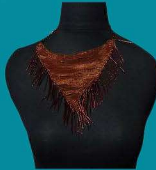
Mesh Necklace (NJN0009)

Available in : Gold, Rose Gold, Silver, and Dark Copper