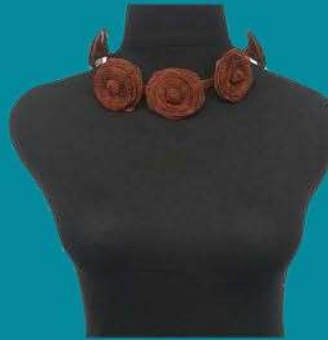
Mesh Necklace (NJN0012)

Available in : Gold, Rose Gold, Silver, and Dark Copper