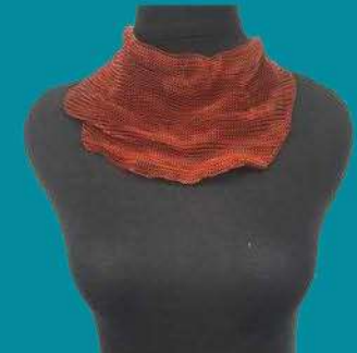
Mesh Necklace (NJN0016)

Available in : Gold, Rose Gold, Silver, and Dark Copper