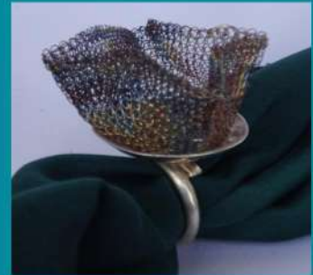
Mesh Ring (NJR0004) Material : 0.3 Millimeters Wire, Handmade.