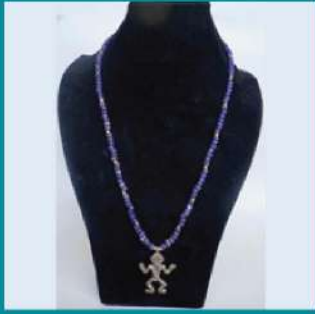
Tanimbar's Necklace (NJN0057) Material : Beads And Metal Length : By Request