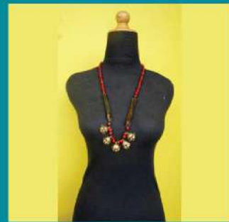
Pentul Tembem Necklace (NJN0063) Material : Water Buffalo Horns, Bead, and Metal Pendant Length : By Request