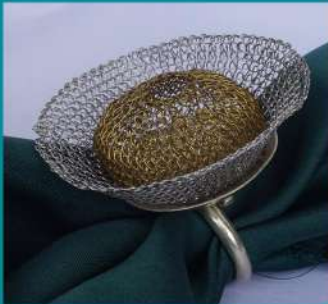
Mesh Ring (NJR0001) Material : 0.3 Millimeters Wire, Handmade.