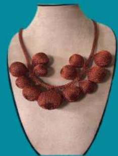
Mesh Necklace (NJN0052) Material : 0.3 Milimeters Wire, Handmade. Available in : Gold, Rose Gold, Silver, and Dark Copper