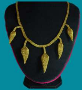
Mesh Necklace (NJN0040) Material : 0.3 Milimeters Wire, Handmade. Available in : Gold, Rose Gold, Silver, and Dark Copper