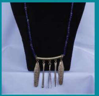
East Indonesia Tools Necklace (NJN0070) Material : Motte Beads and Metal Length : By Request