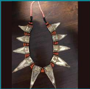
Toraja's Necklace (NJN0069) Material : Traditional South Sulawesi Length : By Request