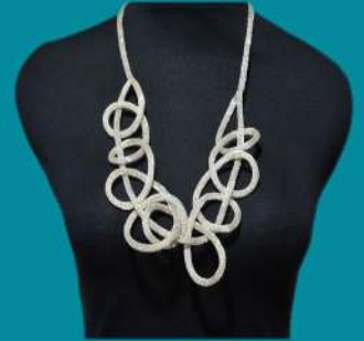
Mesh Necklace (NJN0044) Material : 0.3 Milimeters Wire, Handmade. Available in : Gold, Rose Gold, Silver, and Dark Copper