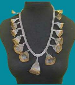
Mesh Necklace (NJN0018)

Available in : Gold, Rose Gold, Silver, and Dark Copper