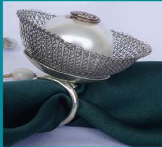
Mesh Ring (NJR0002) Material : 0.3 Millimeters Wire, Handmade.