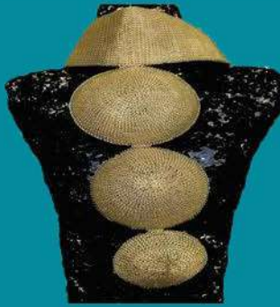
Mesh Necklace (NJN0007)

Available in : Gold, Rose Gold, Silver, and Dark Copper