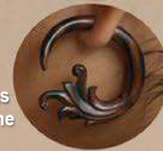
Pierced earrings from water buffalo's bone