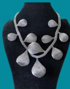
Mesh Necklace (NJN0050) Material : 0.3 Milimeters Wire, Handmade. Available in : Gold, Rose Gold, Silver, and Dark Copper