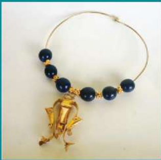
Batak's Necklace (NJN0061) Material : Plastic Beads and Metal Batak's Pendant Length : By Request