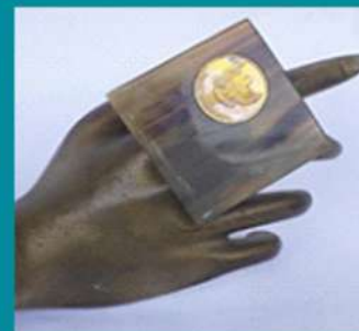
Horn Ring (NJR0014) Material : Water Buffalo Horns, and Indonesian Old Coin.