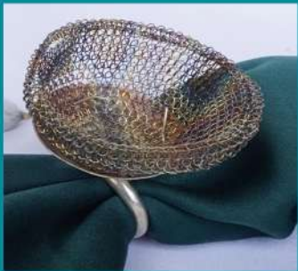
Mesh Ring (NJR0003) Material : 0.3 Millimeters Wire, Handmade.