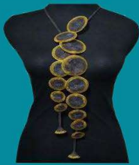
Mesh Necklace (NJN0006)

Available in : Gold, Rose Gold, Silver, and Dark Copper