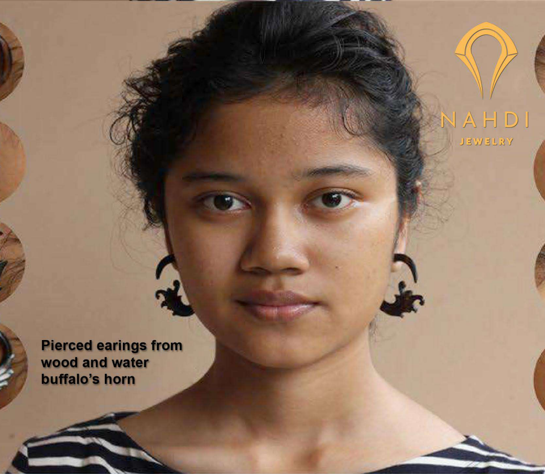
Pierced earrings from wood and water buffalo's horn