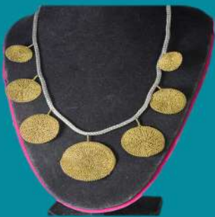
Mesh Necklace (NJN0041) Material : 0.3 Milimeters Wire, Handmade. Available in : Gold, Rose Gold, Silver, and Dark Copper