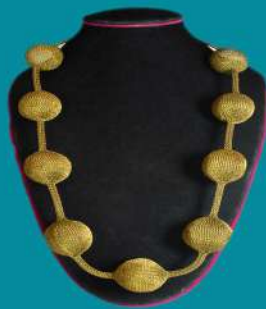
Mesh Necklace (NJN0042) Material : 0.3 Milimeters Wire, Handmade. Available in : Gold, Rose Gold, Silver, and Dark Copper