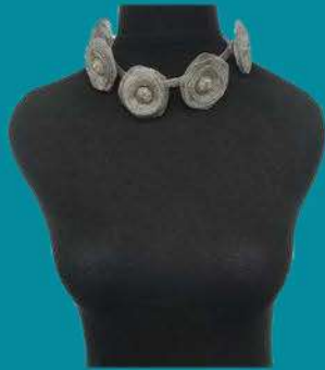
Mesh Necklace (NJN0010)

Available in : Gold, Rose Gold, Silver, and Dark Copper