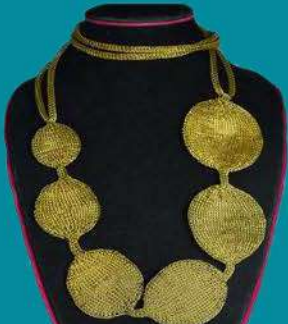
Mesh Necklace (NJN0014)

Available in : Gold, Rose Gold, Silver, and Dark Copper