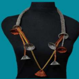
Mesh Necklace (NJN0045) Material : 0.3 Milimeters Wire, Handmade. Available in : Gold, Rose Gold, Silver, and Dark Copper