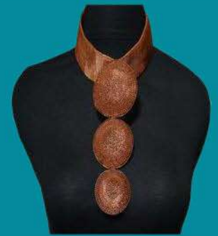
Mesh Necklace (NJN0008)

Available in : Gold, Rose Gold, Silver, and Dark Copper