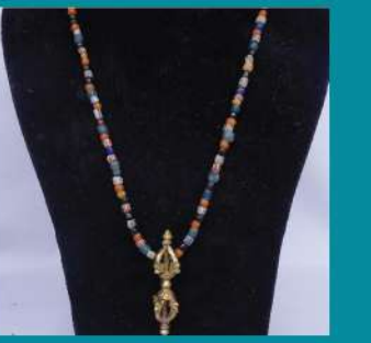
Chakra's Necklace (NJN0072) Material : Bead and Metal Chakra's Pendant Length : By Request