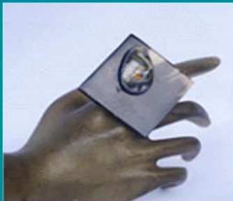
Horn Ring (NJR0007) Material : Water Buffalo Horns, and Stone.