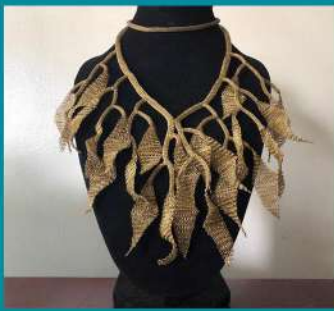
Mesh Necklace (NJN0055) Material : 0.3 Millimeters Wire, Handmade.