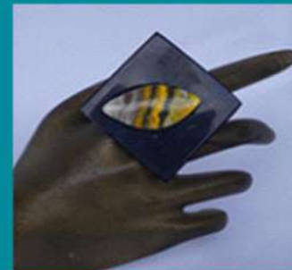
Horn Ring (NJR0011) Material : Water Buffalo Horns, and Stone.