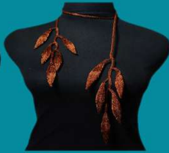
Mesh Necklace (NJN0038) Material : 0.3 Milimeters Wire, Handmade. Available in : Gold, Rose Gold, Silver, and Dark Copper