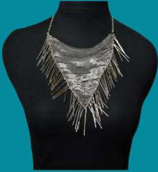
Mesh Necklace (NJN0005)

Material : 0.3 Milimeters Wire, Handmade.