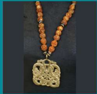
Dayak's Necklace (NJN0062) Material : Rudraksha and Metal Dayak's Pendant Length : By Request