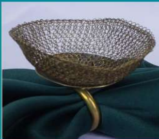
Mesh Ring (NJR0005) Material : 0.3 Millimeters Wire, Handmade.