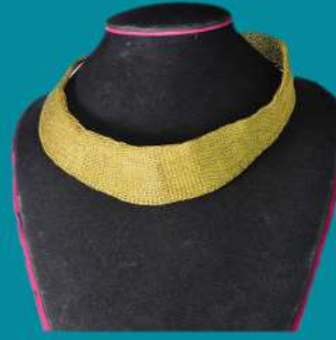
Mesh Necklace (NJN0043) Material : 0.3 Milimeters Wire, Handmade. Available in : Gold, Rose Gold, Silver, and Dark Copper