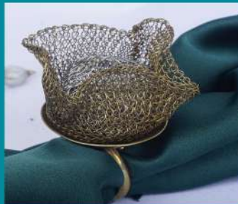
Mesh Ring (NJR0006) Material : 0.3 Millimeters Wire, Handmade.