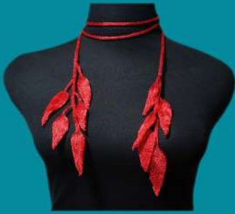
Mesh Necklace (NJN0037) Material : 0.3 Milimeters Wire, Handmade. Available in : Gold, Rose Gold, Silver, and Dark Copper