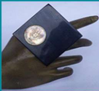
Horn Ring (NJR0009) Material : Water Buffalo Horns, and Indonesian Old Coin.