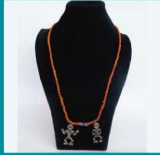
Tanimbar's Necklace (2 Pendant) (NJN0058) Material : Beads And Metal Length : By Request