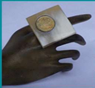
Horn Ring (NJR0010) Material : Water Buffalo Horns, and Indonesian Old Coin.