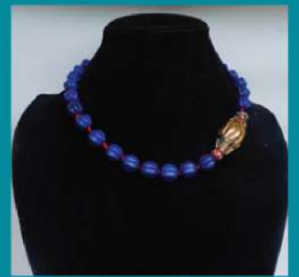
Metal and Glass Beads Necklace (NJN0064) Material : Glass Beads and Metal Pendant Length : By Request