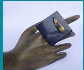
Horn Ring (NJR0008) Material : Water Buffalo Horns, and Stone.