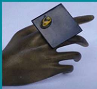
Horn Ring (NJR0012) Material : Water Buffalo Horns, and Stone.