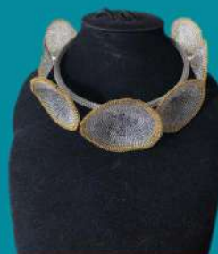
Mesh Necklace (NJN0051) Material : 0.3 Milimeters Wire, Handmade. Available in : Gold, Rose Gold, Silver, and Dark Copper