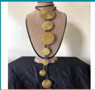
Mesh Necklace (NJN0053) Material : 0.3 Millimeters Wire, Handmade.