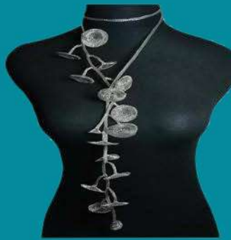
Mesh Necklace (NJN0020)

Available in : Gold, Rose Gold, Silver, and Dark Copper