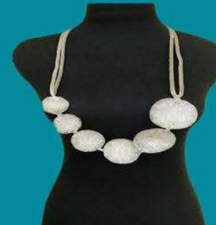
Mesh Necklace (NJN0015)

Available in : Gold, Rose Gold, Silver, and Dark Copper