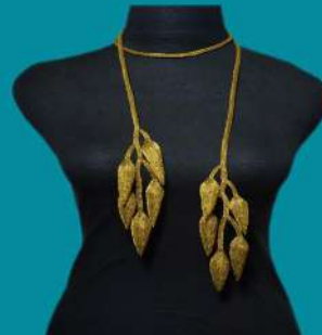
Mesh Necklace (NJN0039) Material : 0.3 Milimeters Wire, Handmade. Available in : Gold, Rose Gold, Silver, and Dark Copper