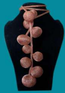
Mesh Necklace (NJN0048) Material : 0.3 Milimeters Wire, Handmade. Available in : Gold, Rose Gold, Silver, and Dark Copper