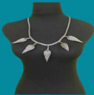
Mesh Necklace (NJN0046) Material : 0.3 Milimeters Wire, Handmade. Available in : Gold, Rose Gold, Silver, and Dark Copper