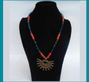
Half Sunshine Necklace (NJN0060) Material : Stone And Metal Length : By Request