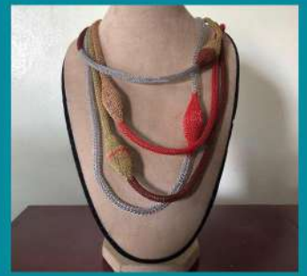
Mesh Necklace (NJN0056) Material : 0.3 Millimeters Wire, Handmade.