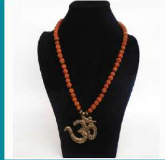
Ohm Necklace (NJN0059) Material : Rudraksha and Metal Ohm Length : By Request