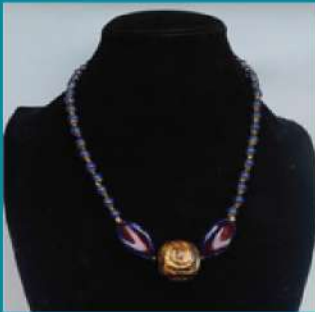
Budha Bead Necklace (NJN0065) Material : Blue Beads and Budha Bead Length : By Request