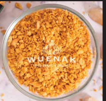
MINCED FRIED GARLIC