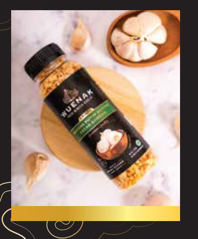
MINCED FRIED GARLIC 120 G

SPICY SHRIMP PASTE FRIED SHALLOT 350 G FRIED SHALLOT 90 G