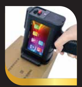
Printed expired date