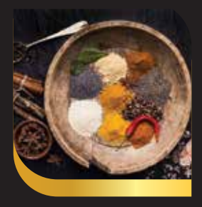
No added flour