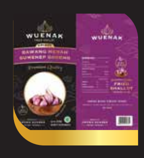
International Barcode (GSI) and nutrition facts on label or pouch