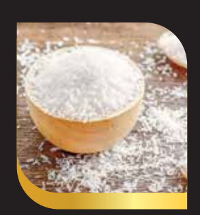
No MSG, No Preservatives, No Artificial flavor