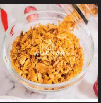
SPICY SHRIMP PASTE FRIED SHALLOT