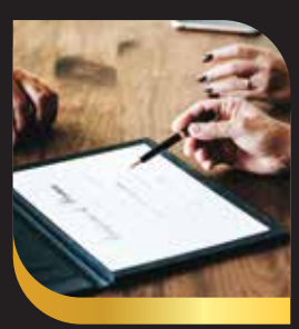
Verified Health Standard from local public health office

The product isn't oily because we have special technique, so the product is very crispy.