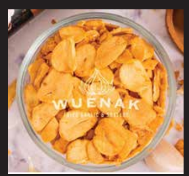
SLICED FRIED GARLIC