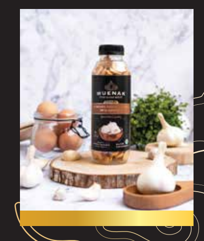
SLIDE FRIED GARLIC 130 G