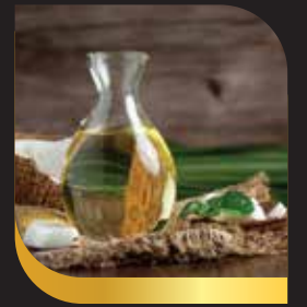
WUENAK FRIED SHALLOT is processed coconut oil which is healthier and more expensive than palm oil