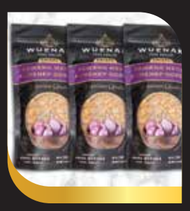
The pouch has zipper