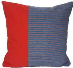
Colonial Trail of Kotagede Series :