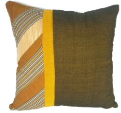
Keraton Yogyakarta Series :