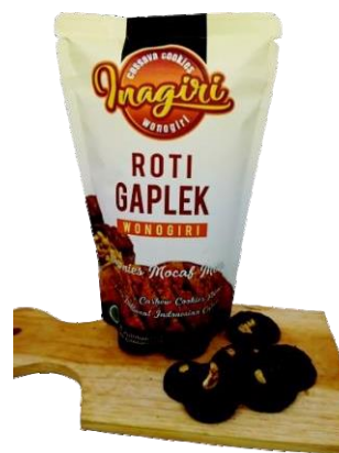
Inagiri Gapek Bread, Cashew Mocaf Brownies variant, net 100 gr,

Ingredients: Mocaf (modified cassava flour), Cinnamon, Palm Sugar, Baking Powder, Butter, and Salt