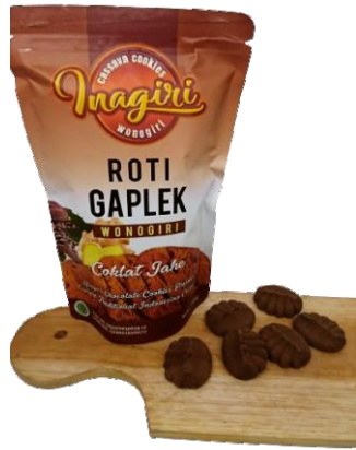
Inagiri Gapek Bread, ChocolateGingervariant, net 100 gr,

Inagiri Gapek Bread uses 100% high quality gapek flour. Formulated with Indonesian spices that are rich in benefits, making this product gluten free and low in sugar. Packaged attractively and made with selected raw ingredients, using a food grade and hygienic automatic cookies machine.