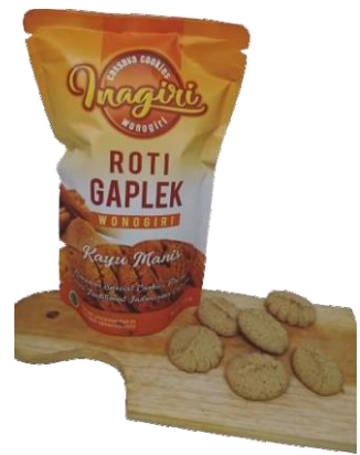
Inagiri Gapek Bread, Cinnamon variant, net 100 gr,

Ingredients: Mocaf (modified cassava flour), Cashew, Cocoa Powder, Palm Sugar, Baking Powder, Butter, and Salt