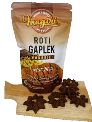
Inagiri Gapek Bread, Chocolate Cashew variant, net 100 gr,

Ingredients: Mocaf (modified cassava flour), Ginger, Cocoa Powder, Palm Sugar, Baking Powder, Butter, and Salt