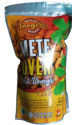
Raw Cashew, Oven Dried, Net 800 gr

Cashews are Wonogiri District's specialties, which also one of Wonogiri's native plants cultivated since the time of our ancestors. The crunchy, sweet, and savoury flavours, make cashews as one of the souvenir choices to be bought when people are visiting Wonogiri. The Wonogiri cashews are also unique, because of their medium size with strong taste.