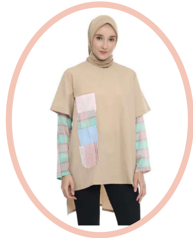
BIANCA TOP IDR 185K

Ceritakan harimu dengan koleksi atasan Blus Patchwork by Vewilma!